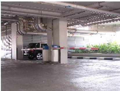
Fairmont Hotel Dubai