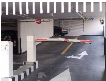
Capricorn Tower Dubai