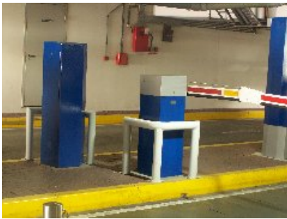
Jumeirah Emirates Towers