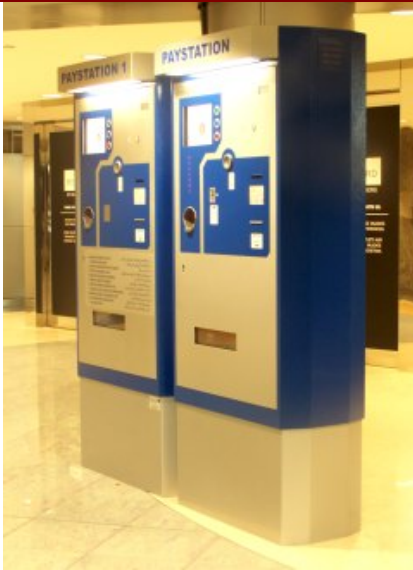
Jumeirah Emirates Towers