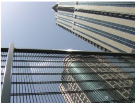
Shangri-La Hotel Towers Dubai