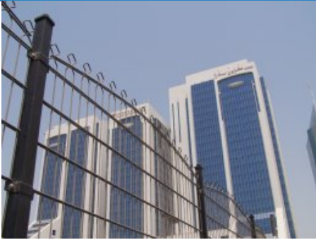
Crown Plaza Hotel Dubai