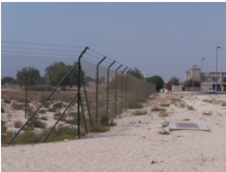
Ministry of Defense - UAE Border Phase one